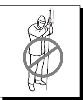
Figure 2: Incorrect probe technique

Figure 1: Correct probe technique - guide with upper hand; feed with lower hand