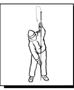
Figure 1: Correct probe technique - guide with upper hand; feed with lower hand

Backcountry Access, Inc. 2820 Wilderness Place, Unit H Boulder, CO 80301 USA (303) 417-1345 info@bcaccess.com